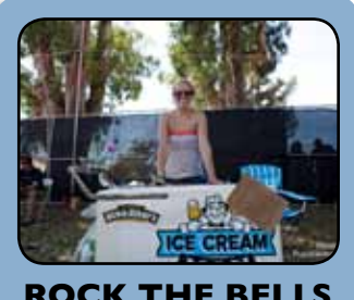
ROCK THE BELLS