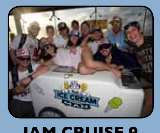
JAM CRUISE 9