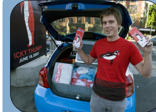
WHITE STRIPES AT ICKY THUMP RECORDS, HOLLYWOOD