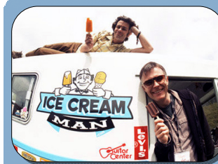
VIRGIN FESTIVAL VANCOUVER