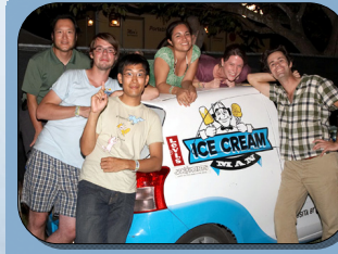
ICE CREAM CREW AT AUSTIN CITY LIMITS