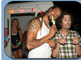
MICHAEL FRANTI OF SPEARHEAD