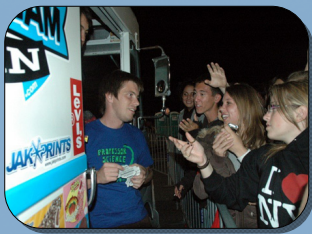
TREASURE ISLAND MUSIC FESTIVAL