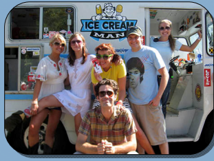
ICE CREAM CREW AT LOLLAPALOOZA