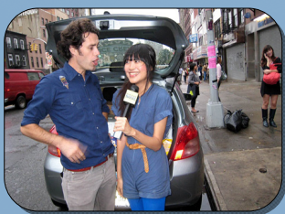
CMJ MUSIC MARATHON