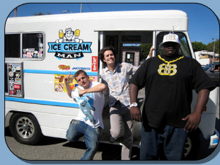
FILMING MTV'S "ROB & BIG"