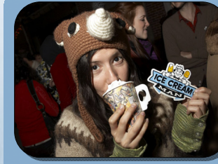
LITTLE RADIO HOLIDAY PARTY