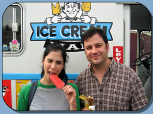
SARAH SILVERMAN AND JIMMY KIMMEL