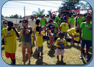
KABOOM! PLAYGROUND BUILD HERMOSA, CA