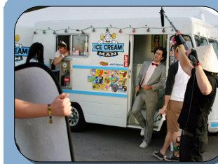
VEGOOSE HALLOWEEN IN LAS VEGAS