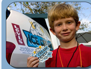
AUSTIN CITY LIMITS