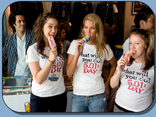
LEVI'S 5/01 DAY IN SANTA MONICA