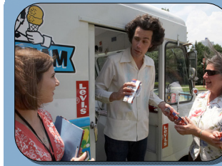
ST. JUDE CHILDREN'S HOSPITAL